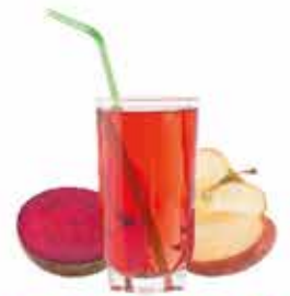
Beetroot and Apple Juice