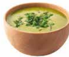
Bottle Gourd Soup