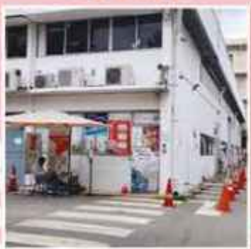
No. 2, Joo Koon Road, Singapore 628966