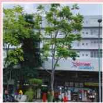
No.3, Soon Lee Street, #04-14, 16,17, Pioneer Junction, Singapore 627606