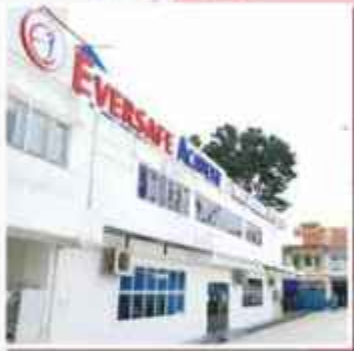
No. 2, Kampong Kapur Rd, Singapore 208674