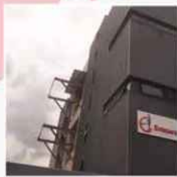
No. 2, Wan Lee Road, Singapore 627934

WE ARE ALWAYS WITH YOU FOR YOUR TRAINING NEEDS