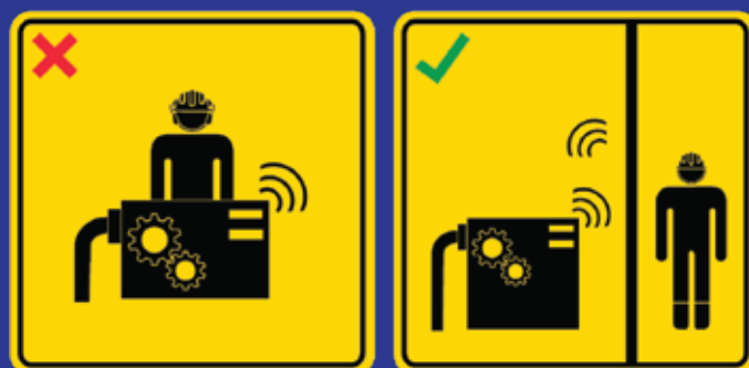
Minimise time spent in noisy areas

These involve changes in work practices or policies to reduce noise exposure. Examples include job rotation to limit individual noise exposure time and planning work schedules to minimize prolonged exposure to loud equipment. Although less effective than upstream controls, administrative controls still play a role in minimizing risk when used in combination with other measures.