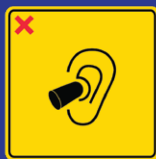
Put on your hearing protector properly