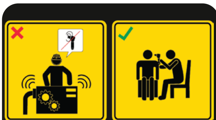
Go for yearly audiometric examination

Audiometric examinations play a vital role in monitoring workers' hearing health and detecting early signs of NID. New hires should undergo audiometric testing within three months of starting employment, while existing workers exposed to excessive noise should be tested annually. Tests should be conducted by trained personnel in an audiometric booth to ensure accuracy. To obtain reliable results, workers should limit their noise exposure for at least 16 hours before the examination.