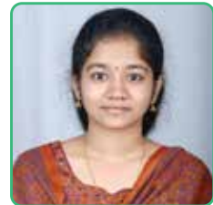
2 ELIZABETH - 426,311 STEPS