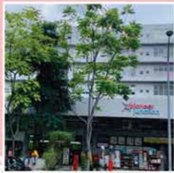
No.3, Soon Lee Street, #04-14, 16,17, Pioneer Junction, Singapore 627606