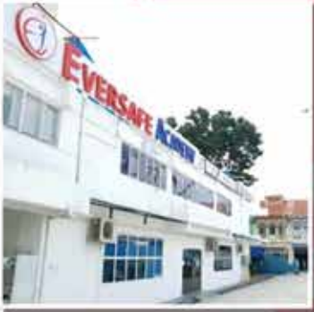
No. 2, Kampong Kapur Rd, Singapore 208674