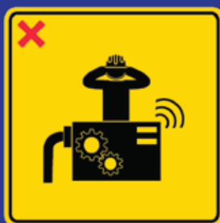
Use hearing protectors in noisy areas

Hearing protectors, such as earmuffs and earplugs, should be provided to workers exposed to noise levels above 85 dB(A). These devices need to have a certified Noise Reduction Rating (NRR) to ensure they can effectively reduce noise exposure. Worker training is crucial to emphasize the impact of noise on hearing, the importance of wearing hearing protection, and the correct way to use the equipment. Displaying warning signs at the entrances to noisy areas serves as a reminder for workers to put on their hearing protectors.