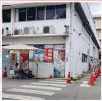
No. 2, Joo Koon Road, Singapore 628966